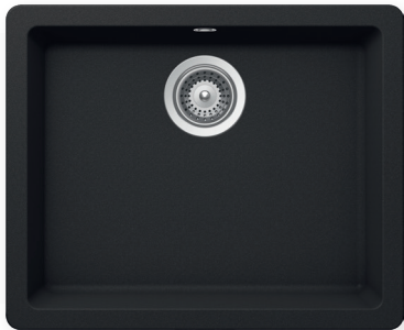
QN-100B product shown