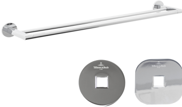
Includes Round & Soft Square Flanges